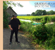
Back to the Soul