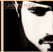
Blind to Reason