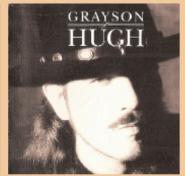
Road to Freedom